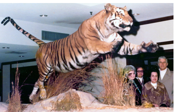
ordered the taxidermist to close the tiger's mouth.