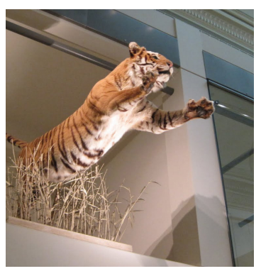
Today, the tiger is on display in a second story alcove overlooking the museum's mezzanine.